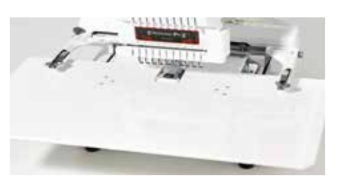
Table to support extra-large projects

Embroider multi-coloured designs quickly and easily. Upper and lower thread trimmers eliminate time-consuming trimming when the embroidery is complete.