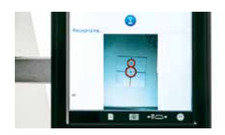
Camera positioning sensor Rotate and position the embroidery exactly where needed, thanks to the built-in camera.

Real-time viewing of fabric within the embroidery frame to help you place the design exactly where you want it.