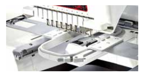
Sleeve Frame (70 x 200 mm)

The clamp frame kits are ideal for adding embroidery to shoes, inner jacket pockets, cuffs, gloves and much more. Clamp frame size 45 x 24 mm.