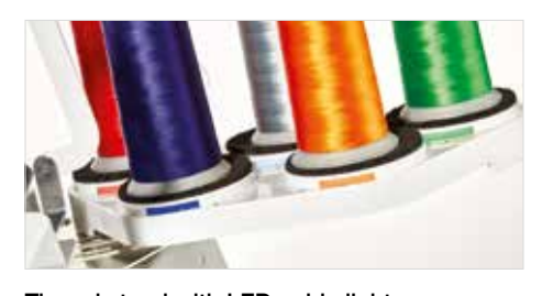
Thread stand with LED guide lights Multi-coloured LED lights help to show the position of broken threads, the position when a thread needs changing and the position thread for each colour used.

Connect a USB device such as a USB flash drive or a card reader/writer. Or read PES files from a SD card.