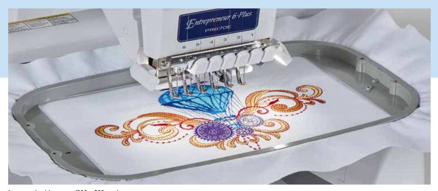
Large embroidery area (300 x 200 mm) The large embroidery area and variety of included and optional frames gives you the flexibility to create a multitude of projects from jackets and t-shirts to socks and baby clothes.

The PR670E embroidery machine is the perfect choice for a small or home-based business and sewing enthusiasts. Its guick set up and fast multi-needle embroidery enables you to embroider large multi-coloured designs with minimum thread changes and greatly increased productivity compared to traditional single-needle machines. Plus, you can enjoy more creativity with its customisation features.