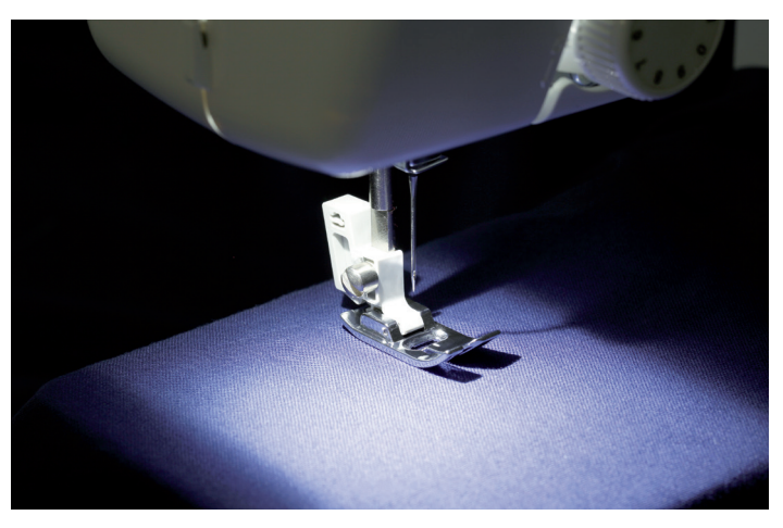
LED lighting for easy viewing