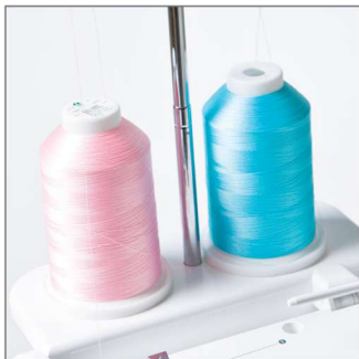
King spool stand

The new LED pointer embroidery foot helps create perfect needle placement for embroidery. The LED pointer shows clearly where the needle will drop, making adjustments as easy as touching a few buttons on the LCD screen.