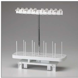
10-spool thread stand

The 10-spool thread stand snaps securely onto your machine to provide 10 vertical spool pins, for thread delivery or bobbin storage, and allows easy access to frequently-used thread colours.