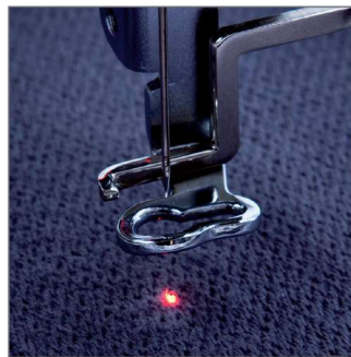
LED pointer embroidery foot

Allows you to create continuous patterns and borders.