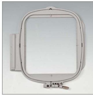
150 mm 150mm quilting frame

The 10-spool thread stand snaps securely onto your machine to provide 10 vertical spool pins, for thread delivery or bobbin storage, and allows easy access to frequently-used thread colours.