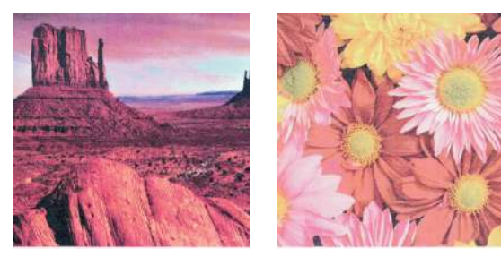
Sample prints using third-party toners as tested by Buyers Lab -highlighting the colour variance.