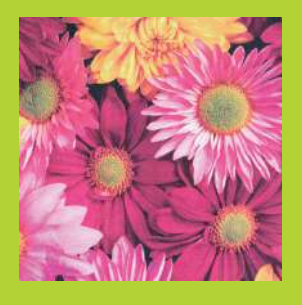
Sample print using Brother Genuine Supplies as tested by Buyers Lab

The right colour match and consistent colour production is vital – especially when it comes to things like company logos. Brother Genuine Supplies deliver a brilliant colour range and consistent colour quality from first page to last<sup>2</sup>. The non-genuine brands in Buyers Lab's tests, however, showed a small colour range and large colour variance, resulting in greater inconsistency in colour production<sup>2</sup> .